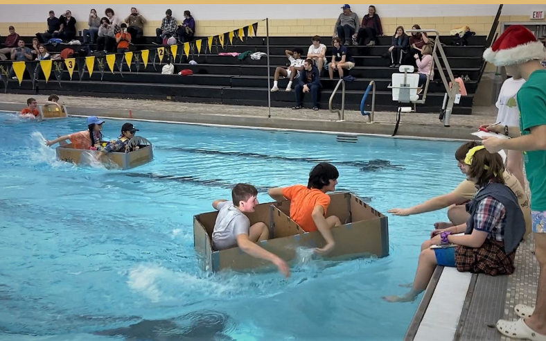
Students, above, attempt to paddle across the Millersville University pool during the Cardboard Regatta. In upper right photo, extra weight is added to capsize the boats.

PMHS students design, build boats to race at MU pool