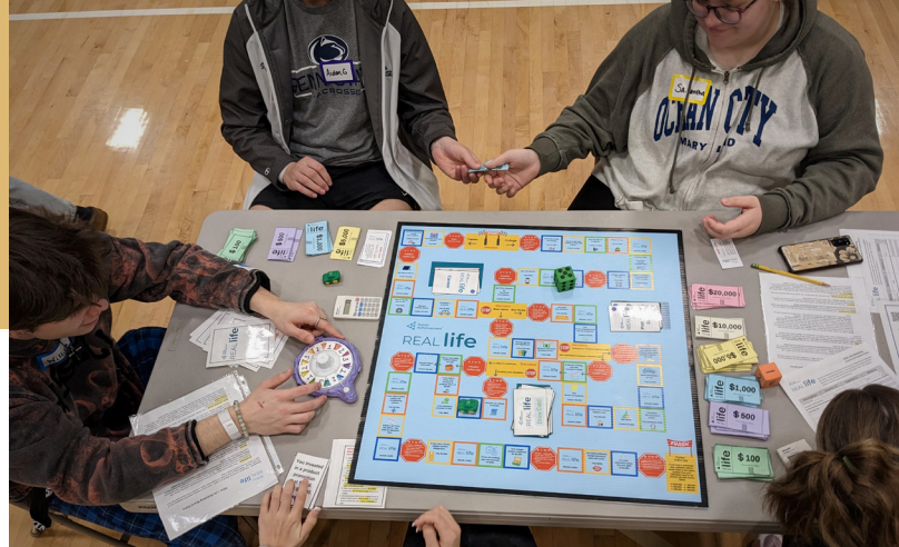
Students, above, participate in a game that challenged them to make sound financial decisions as part of REAL Life activities. In photo below, students create foam hands by mixing chemicals together during the STEM Summit.

They had to determine how much of their income was available to them each month