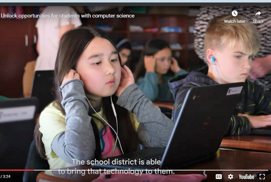
A screenshot from the video

Many thanks to our students and staff, as well as Google, for making this opportunity possible.