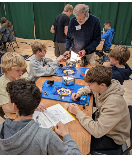
Students test their electrical wiring skills during the STEM Summit.

On February 28 and March 1, all high school juniors