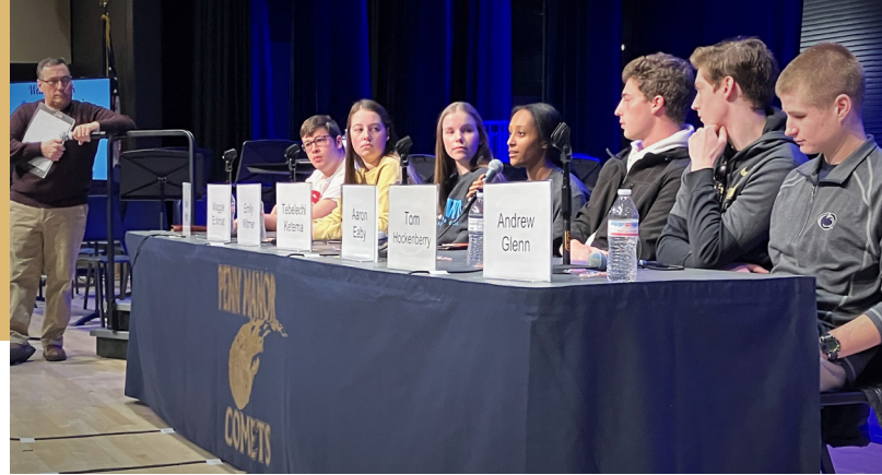
Recent Penn Manor graduates, above, talk about college life with high school seniors. In photo below left, graduates, ranging from the Class of 1987 to 2005, talk to Penn Manor teachers about the skills students need to succeed in the workforce.