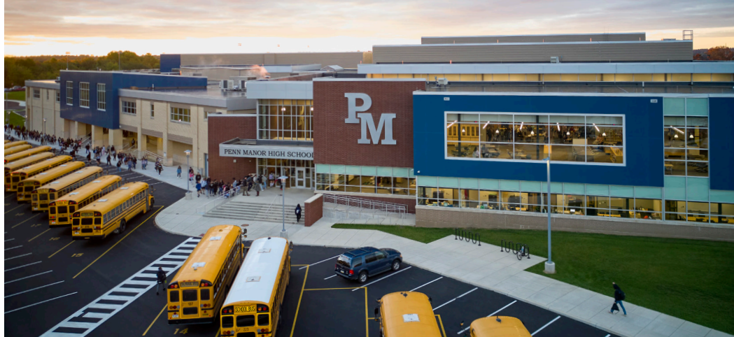
Penn Manor High School will officially mark its completion during a Dedication Celebration Weekend April 14 through 16.